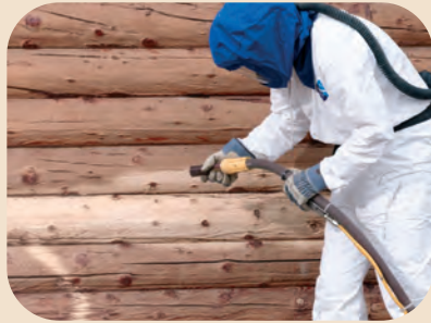
Corn Cob or Glass Blasting (Recommended method)

Prep the log surfaces using the method that will give you the finished appearance that you desire.