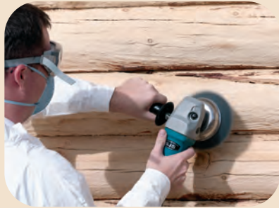
Osborn® Brush (Recommended method)

Hand finish the log surfaces to remove “felting” from power washing, once the logs are dry, or to lessen the texture caused from media blasting.