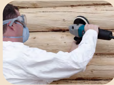
Sashco's Buffy Pad™ System or 3M® Non-woven Pad