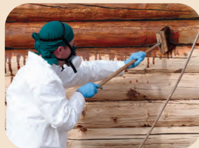
Immediately, vigorously back brush.