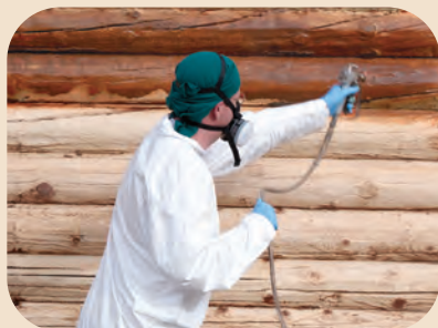
Spray on stain using a Graco #313 tip or equivalent.

Allow time for the PeneTreat® solution to dry, (usually 1-3 days depending on the weather—check the moisture content with a moisture meter) and then spray on—to the point of running—one heavy coat of Capture Log Stain. If only a brush is used, be sure to drench-apply the stain—don't skimp. Coat log ends multiple times to ensure the pores are sealed.