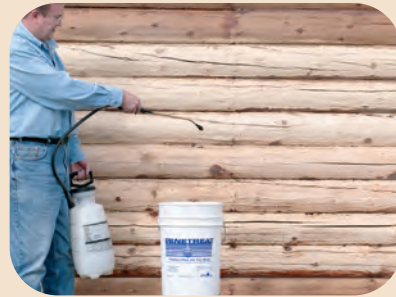
Apply Wood Preservative